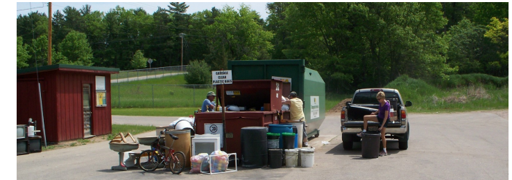
Residents drop off garbage at the town's Recycling and Collection Center on Cloverleaf Lake Road.

Veolia, Waste Management and Harter's Fox Valley Disposal from Wittenberg are expected to compete for the contract. Harter's serves 19 municipalities in Shawano County.